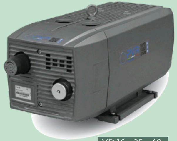
VD 16 - 25 - 40

Food industries, chemical, pharmaceutical, packaging & handling plastic, electrical industry, medical & other applications.